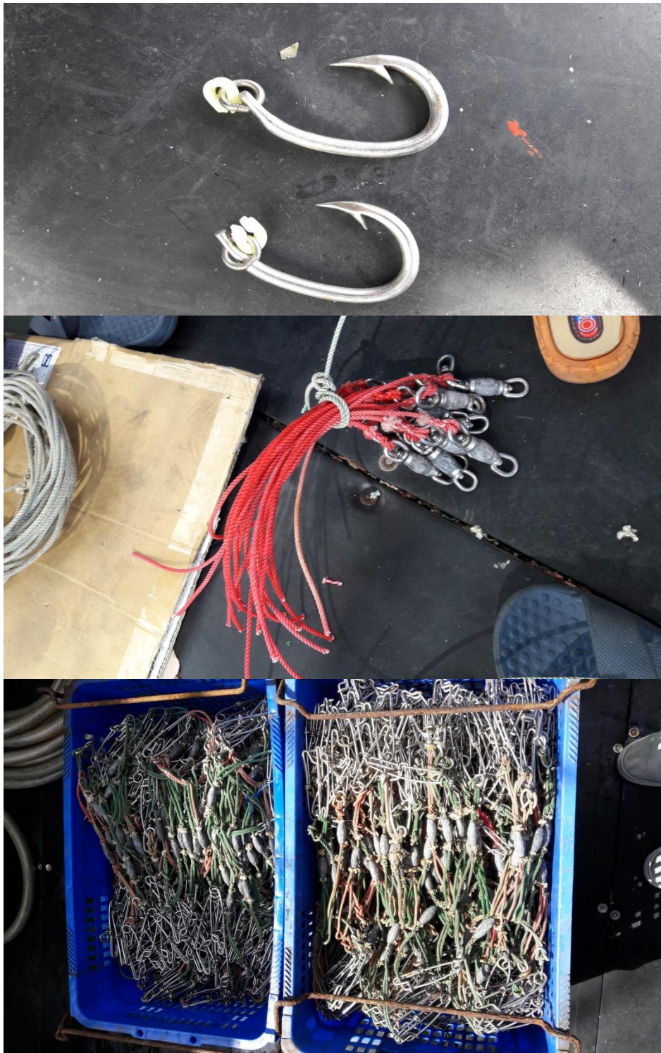
Figure 1: Types of hooks and line weights used in the sampled fishing vessel in 2016 and 2017