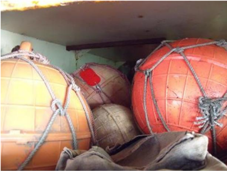
Figure 1 Unmarked buoys typically found during inspections.